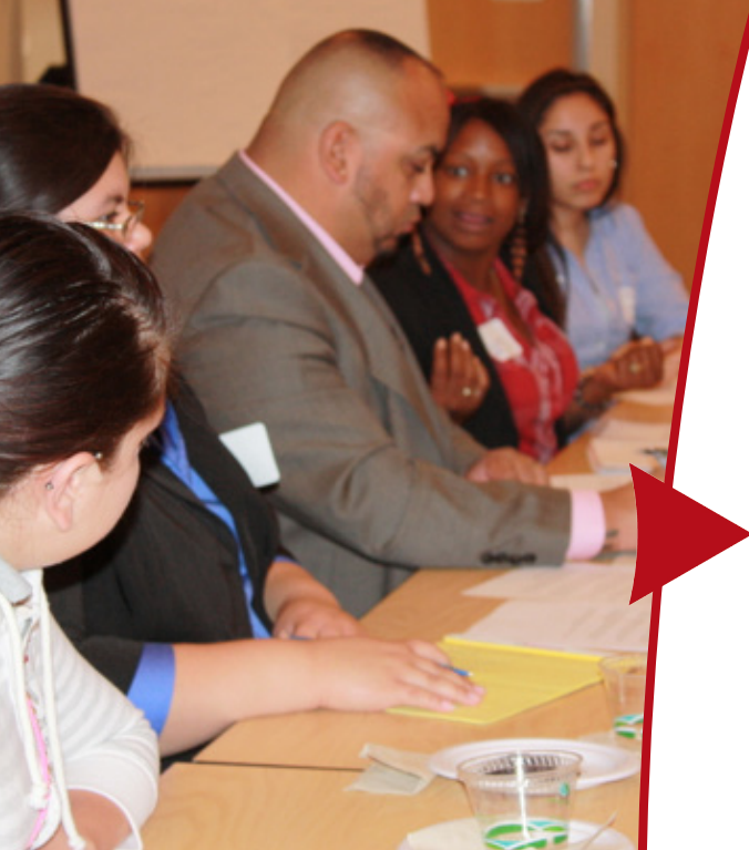
Participants of the Youth Town Hall discuss Higher Education.