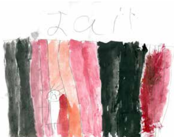
Artwork from Youth Participants