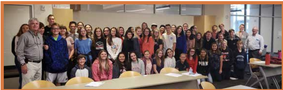
Participants at the Yavapai College - Prescott Campus Future Leaders Town Hall