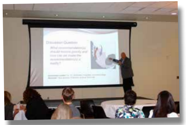
Sierra Vista, AZ